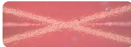
nyloprint® WS 73