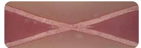
nyloprint® WS 73 Digital