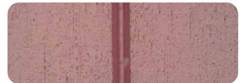
nyloprint® WS 73 Digital

Please contact us for additional information.