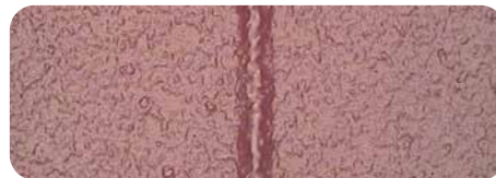
nyloprint® WS 73