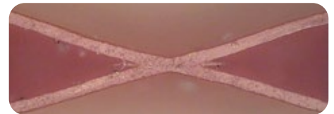
nyloprint® WS 73 Digital