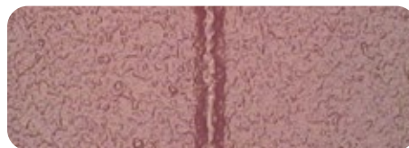
nyloprint® WS 73