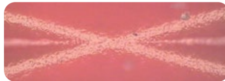
nyloprint® WS 73